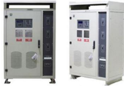
INDUSTRIAL BATTERY CHARGER/RECTIFIER