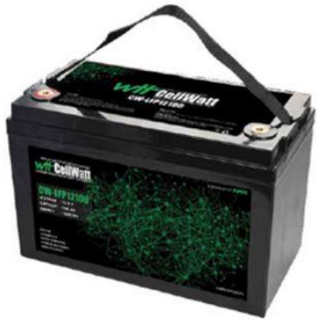
LITHIUM IRON PHOSPHATE BATTERIES