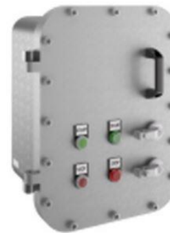
JUNCTION BOX SS 316