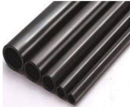
ALL TYPES OF PIPES