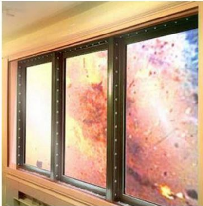
BLAST PROOF WINDOWS