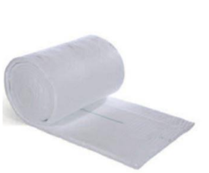
CERAMIC FIBRE BLANKET