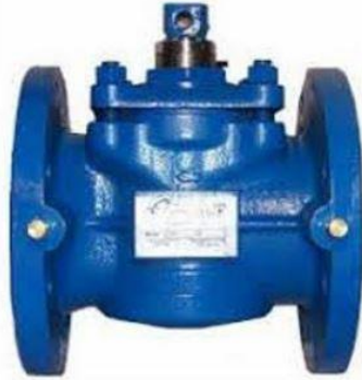
TRIPPLE DUTY VALVE