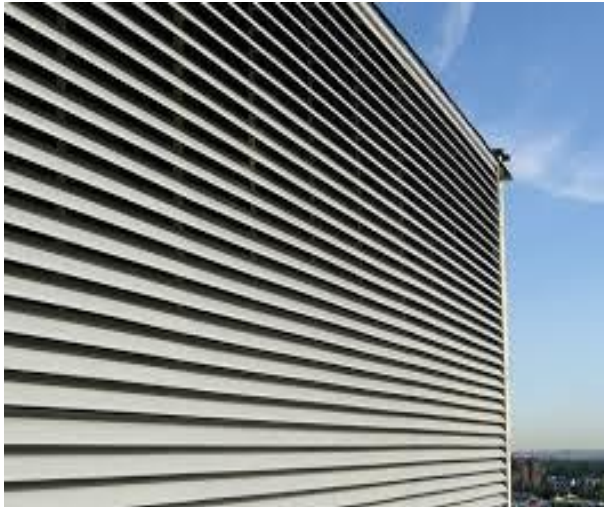
SAND TRAP LOUVER