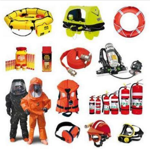
INDUSTRIAL SAFETY ITEMS