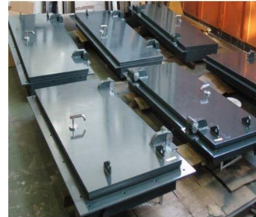
BLAST PROOF DOORS