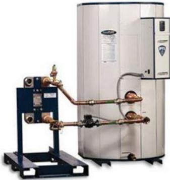
DYNAMIC WATER HEATING