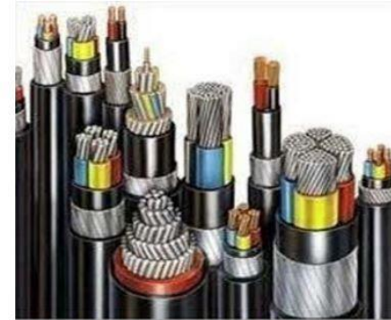
INSTRUMENTATION & ELECTRICAL CABLES FOR OIL & GAS