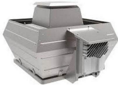
INDUSTRIAL EXHAUST FAN