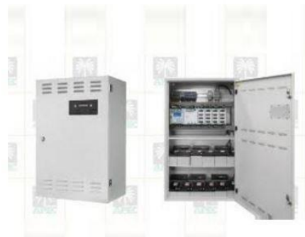
CENTRAL BATTERY SYSTEMS