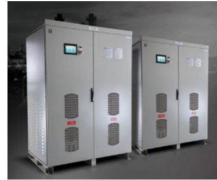
INDUSTRIAL & COMMERCIAL UPS