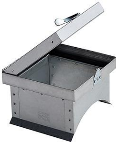
HATCHES & ACCESS DOORS