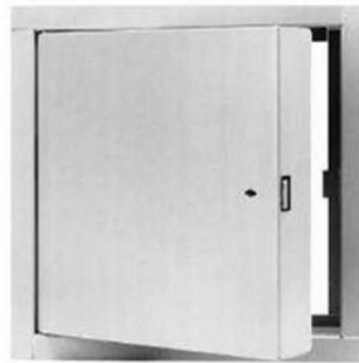
HATCHES AND ACCESS DOORS