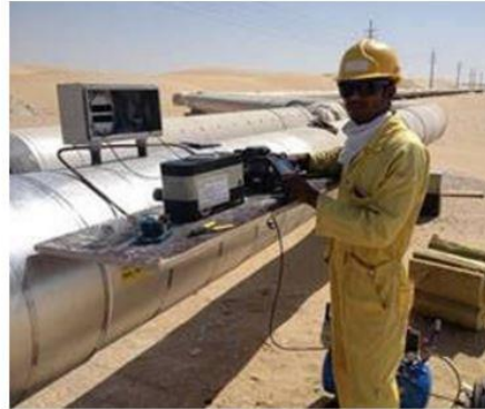
LEAKAGE DETECTION SYSTEMS