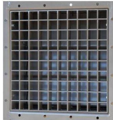
BLAST PROOF DAMPER