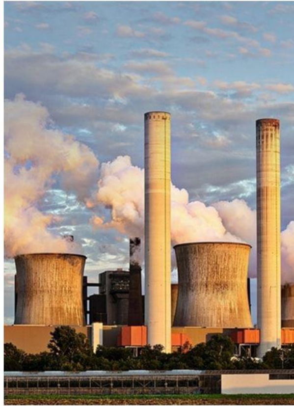
OIL AND GAS INDUSTRY