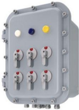
JUNCTION BOXES & CABLE GLANDS