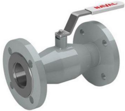
STAINLESS STEEL BALL VALVES