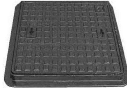
MANHOLE COVER AND HATCHES